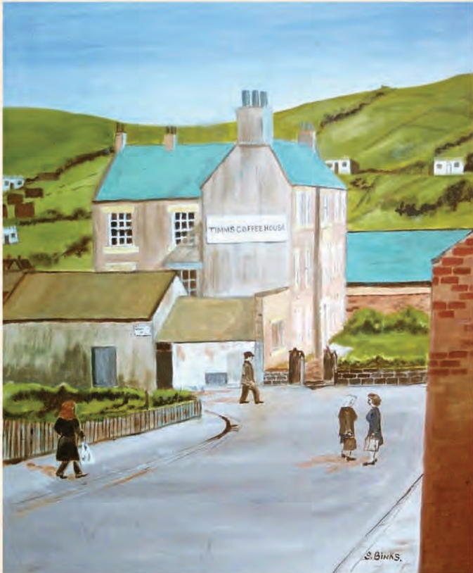
A heritage walk through some local history

This is two years before mining of a major ironstone seam began in the valley and the area was transformed dramatically.