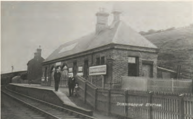
Skinningrove Station above the village on the Loftus to Middlesbrough line. It opened in 1875 and closed in 1958.

Skinningrove Zig Zag Railway Project is a joint venture between Cleveland Ironstone Mining Museum and Cleveland Model Railway Club. See their websites for information about this ambitious project to build a working scale model of Loftus mine, the internal railway system and part of the zig zag connection to the main line.