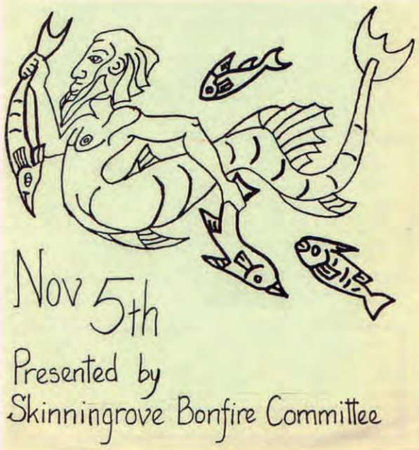
The merman was the theme for the 1984 bonfire.