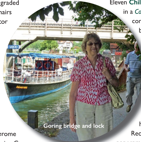
Goring bridge and lock

Miles of towpaths and level or gently graded footpaths, many accessible to wheelchairs and mobility scooters, enable the visitor to explore the Thames and enjoy magnificent views of the unspoilt scenery on its Oxfordshire and Berkshire banks. Linking these historic counties is the picturesque Goring bridge . Its adjacent river lock and nearby open spaces are ideally accessible spots for the perfect summer picnic. Kenneth Grahame and Jerome K Jerome found inspiration in the Goring Gap for their classic tales, The Wind in the Willows and Three Men in a Boat . Oscar Wilde, who lived briefly in Goring, was inspired to give local place names to six of his characters in An Ideal Husband . Today's visitors find inspiration in the scenery, the warm welcome and the unrivalled hospitality. For what else to see and do and where to stay in the Goring Gap go to: ❖ www.withymead.co.uk ❖ www.visitgoringandstreatley.co.uk ❖ www.bbowl.org.uk/reserves/Hartslock ❖ www.visitthames.co.uk/about-the-river/river-thames-locks/goring-lock