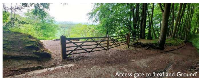
Access gate to 'Leaf and Ground'

old coach road from the Vale. The mounting stone 3 immediately when changing horses at the top of the climb. Turn right along the stone track for approximately 200m then bear left towards Stinchcombe Hill House on your left. Pass in front of the entrance to the house.