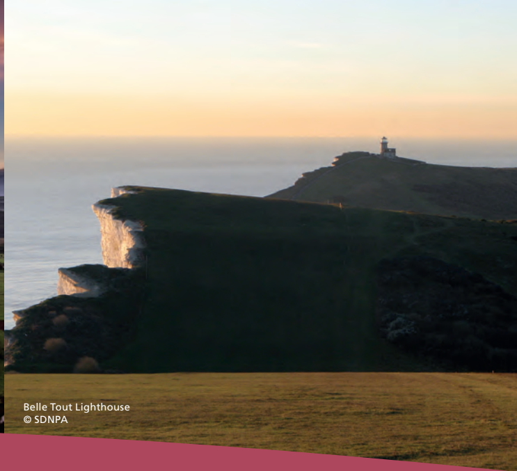
Belle Tout Lighthouse