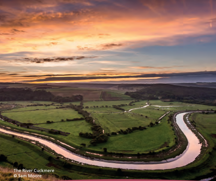
The River Cuckmere