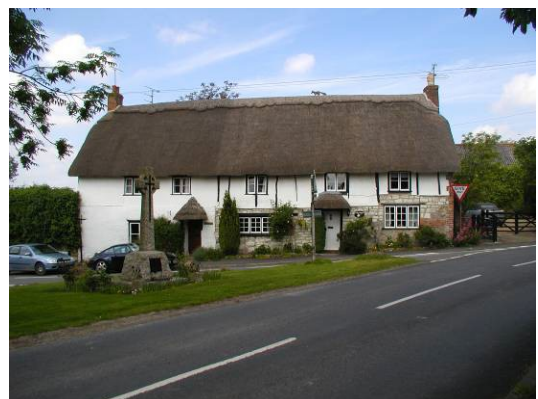
Cottages in Ashbury