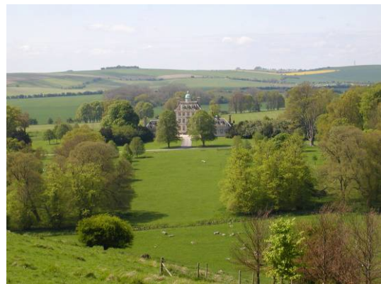
Ashdown House and Park from between points 4 and 5