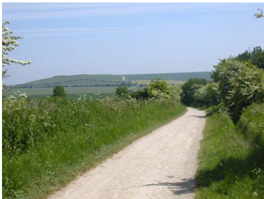
Downland view from The Ridgeway before point 2