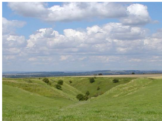
Looking back at the coombe from The Ridgeway