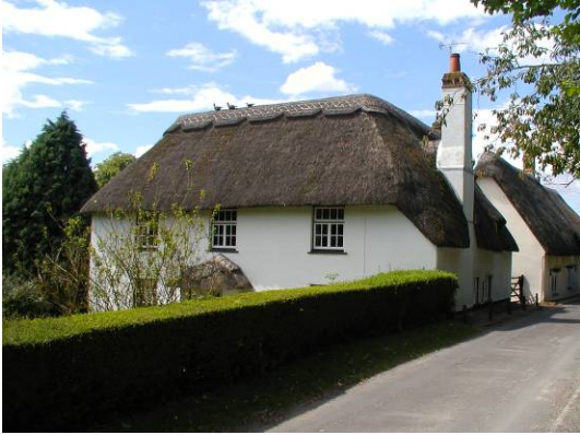
Cottage in Bishopstone