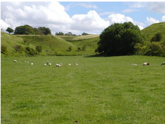
Heading up the coombe