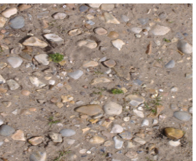
Type of path surface between Wells and Holkham

4 After the gate, walk past the boating lake, and take the first left. The path here is wide, sandy with some loose stones and occasional tree roots that can be avoided. This section has seats every 600m.