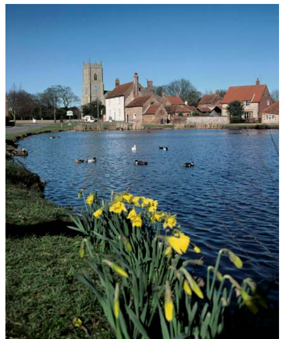
© Countryside Agency - Photographer Andy Tryner 03-7829

At the A148 cross straight over and keep straight, crossing the B1153 and two minor roads and on to Fring.