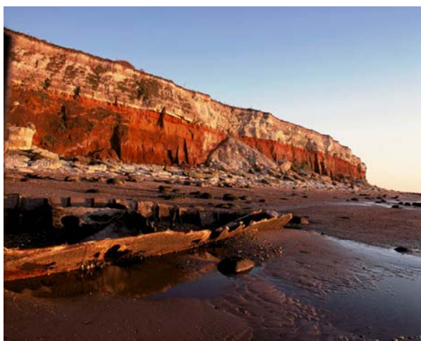
© Countryside Agency - Photographer Andy Tryner 03-7823

Keep straight on, crossing a minor road and leaving Courtyard Farm on the left. At the next T junction, turn right (you can ride in the field). Continue to the cross roads and turn left. Where the road turns right, take the grassy track which goes straight on, climbing steeply to the next road. The climb is worthwhile as, at Beacon Hill 160 feet above sea level, one can see the sea and journey's end in the distance. This is a really thrilling moment. Turn left and within a few yards leave the tarred road, keeping straight on along the old highway called Green Bank, the site of an Iron Age hoard found in the '50s. Keep straight on to the Ringstead Road. At the tarred road turn left and right and follow round to the right on the RUPP leading to Holme-Next-The-Sea, crossing the A148 on the way.